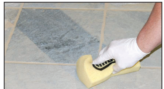
Wash after 30 to 40 minutes*