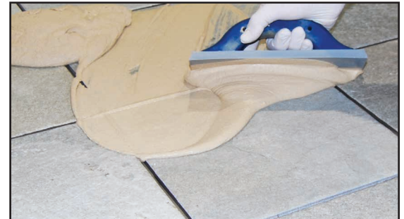
Revolutionary new creamy, smooth consistency